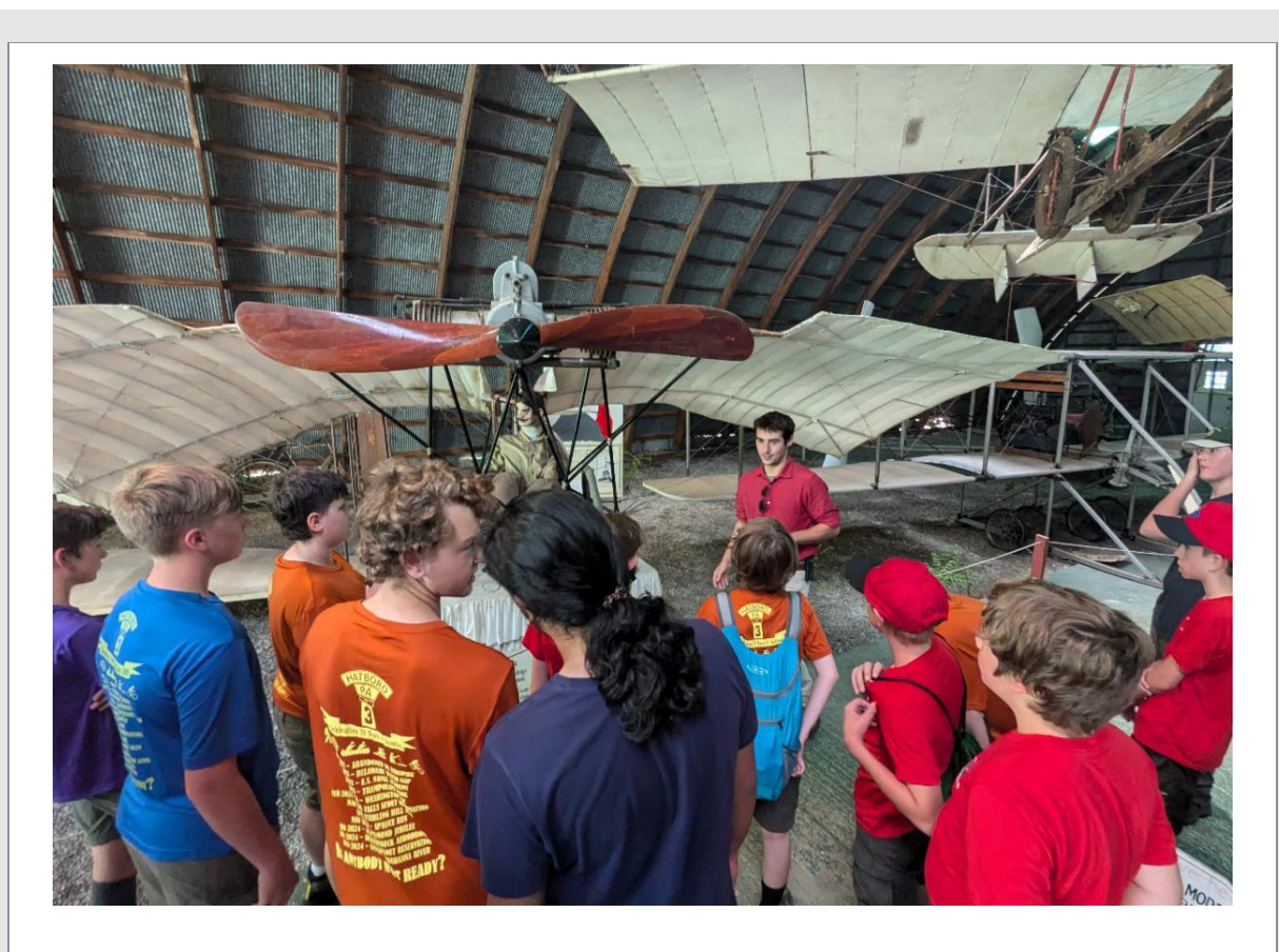
On June 21-23 our June Trip took us up to the Hudson Valley of New York State. We camped right on site at the Old Rhinebeck Aerodrome, and it was a hot one! Saturday morning we had a great museum tour from a recent Eagle Scout.