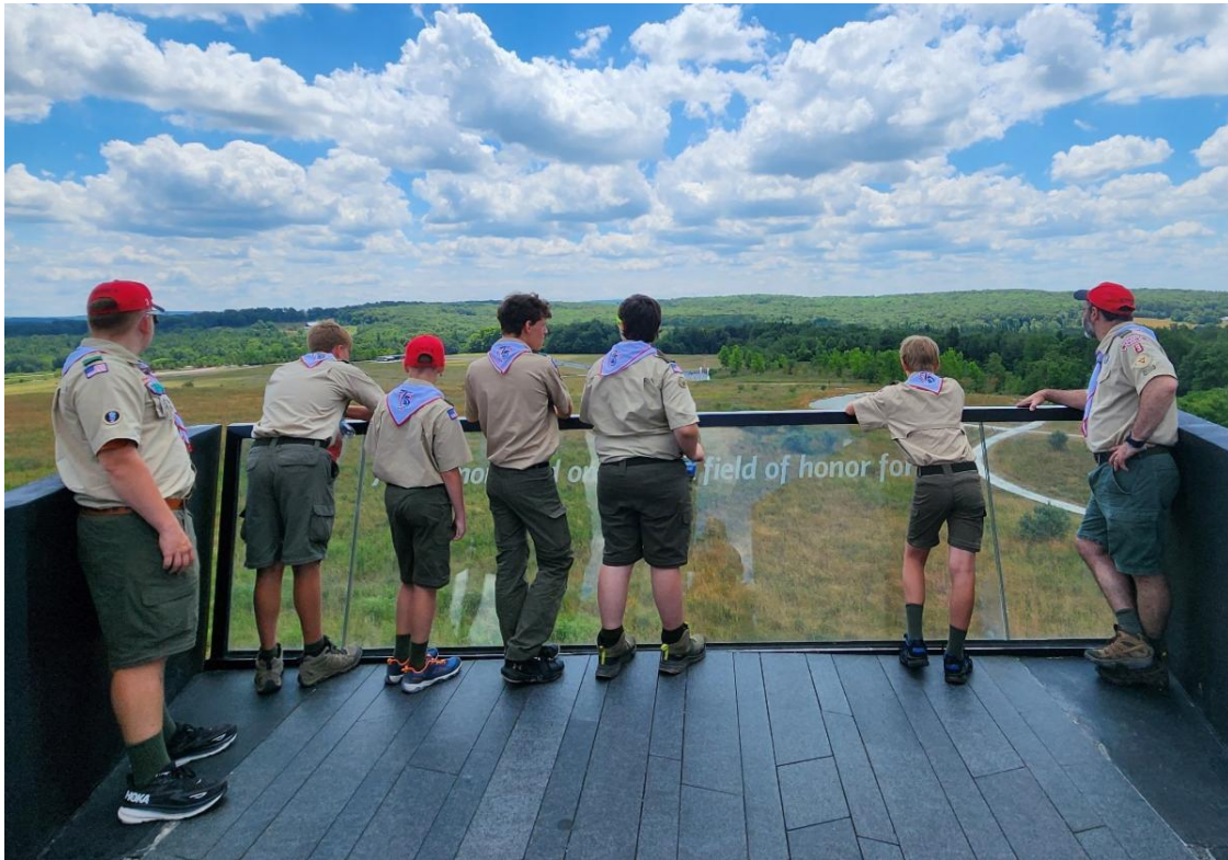
Flight 93 National Memorial in Shanksville, PA

September 11, 2001, America was stunned and knocked on our heels after a second plane struck the Twin Towers, and the Pentagon was hit. In their final moments, a small group of ordinary citizens banded together and struck back for America, likely sparing an attack on the Capitol. True Heroes.