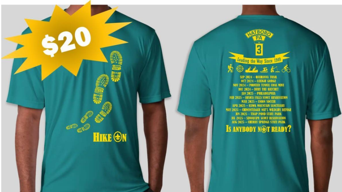
Sport-Tek Competitor Performance Shirt Yellow on Tropic Blue

Now that the Annual Plan is set, we can order the 2024-2025 Troop T-Shirts! Please click the button below and complete the Google form. You can pay when they arrive.