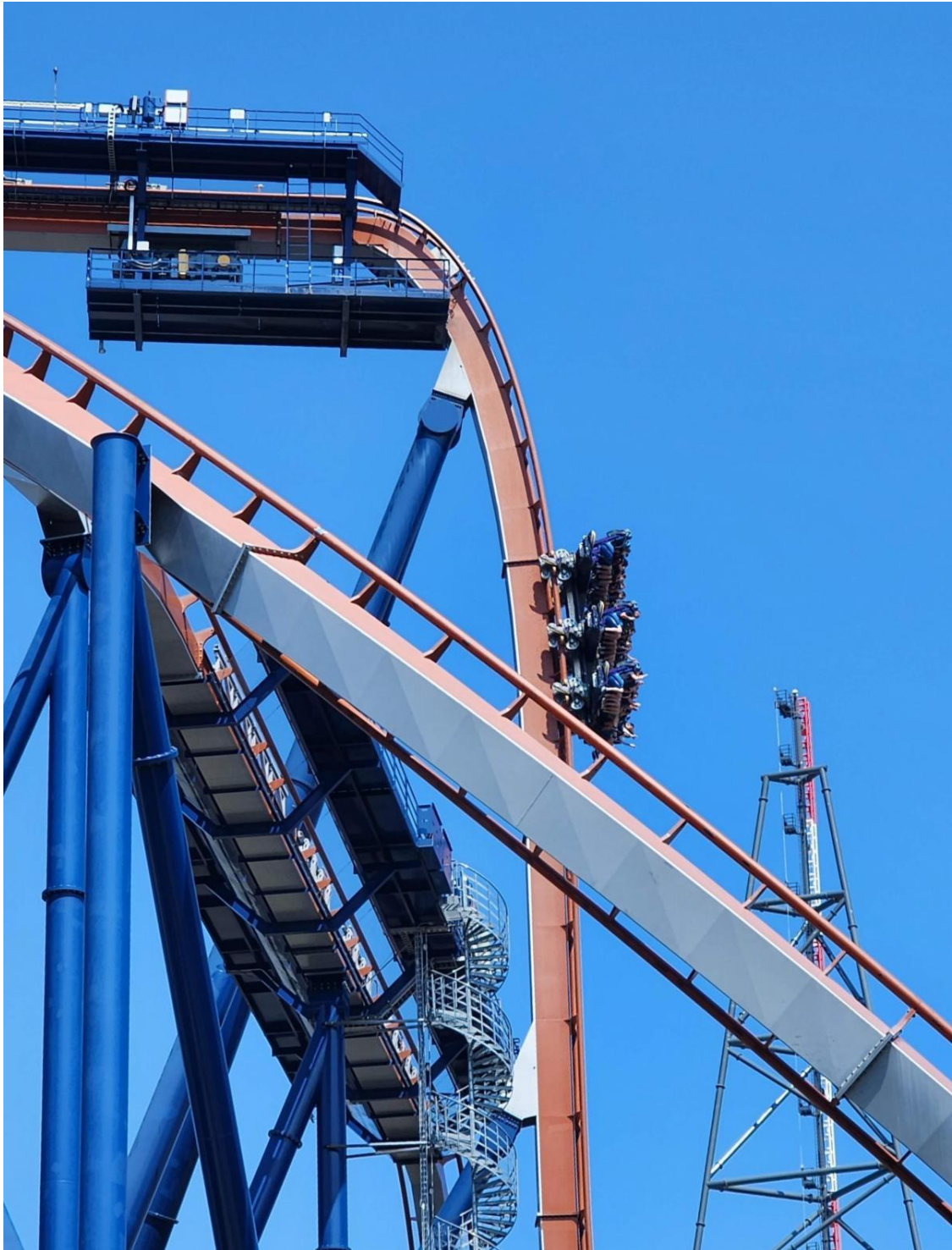
Valravn, 223 ft tall, top speed 75 mph!