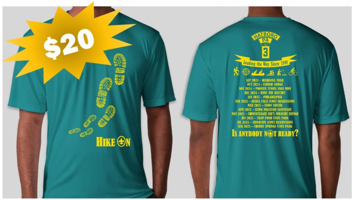
Sport-Tek Competitor Performance Shirt Yellow on Tropic Blue

The 2024-2025 Troop T-Shirts are on order and will be available in a couple weeks! You can pay by cash or check when you pick them up or pay by Cheddar Up by clicking the button below.