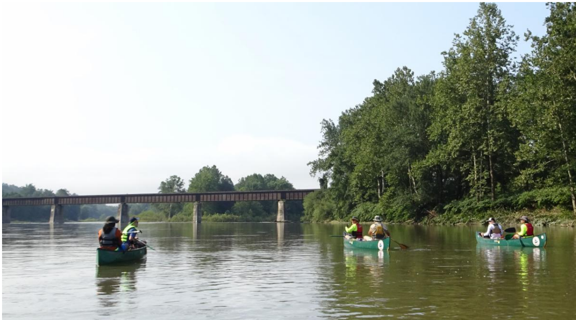
August - Here we are heading into Towanda, land of the storied "Strainer".