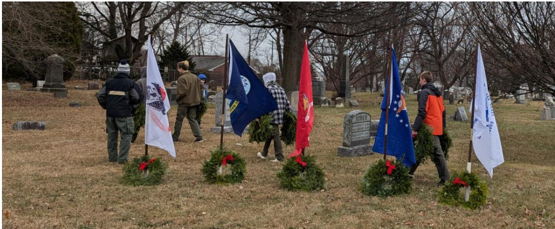
December - Wreaths Across Hatboro at the Veteran's Memorial in Hatboro Baptist Cemetery.