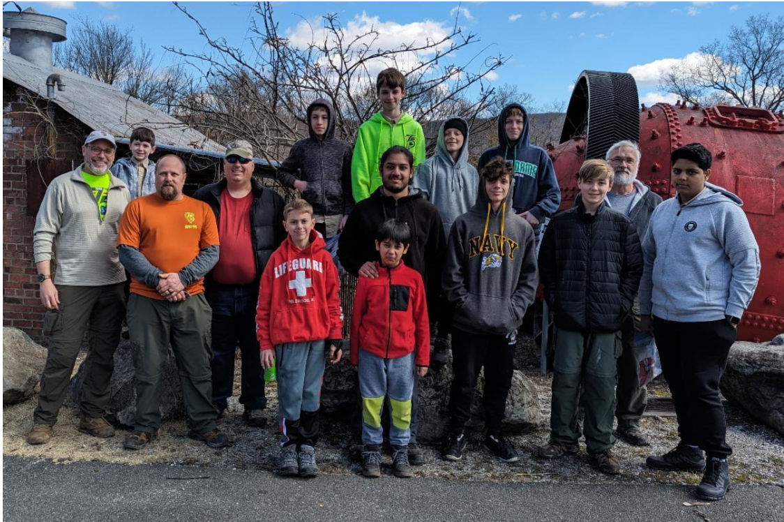
March - We finally made it back to Sterling Hill Mine! This trip was cancelled several times over the last two or three program years for various reasons.