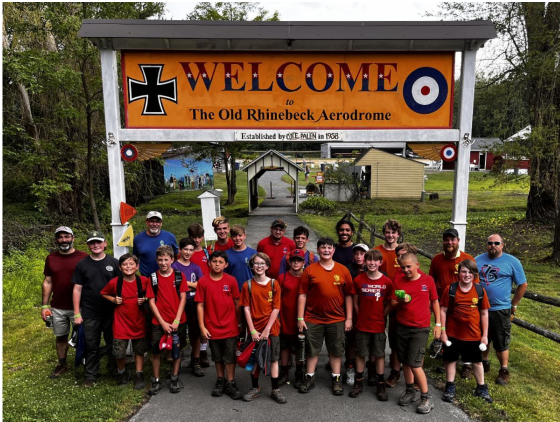
June - We headed up to the scenic Hudson Valley of New York State for the Old Rhinebeck Aerodrome.