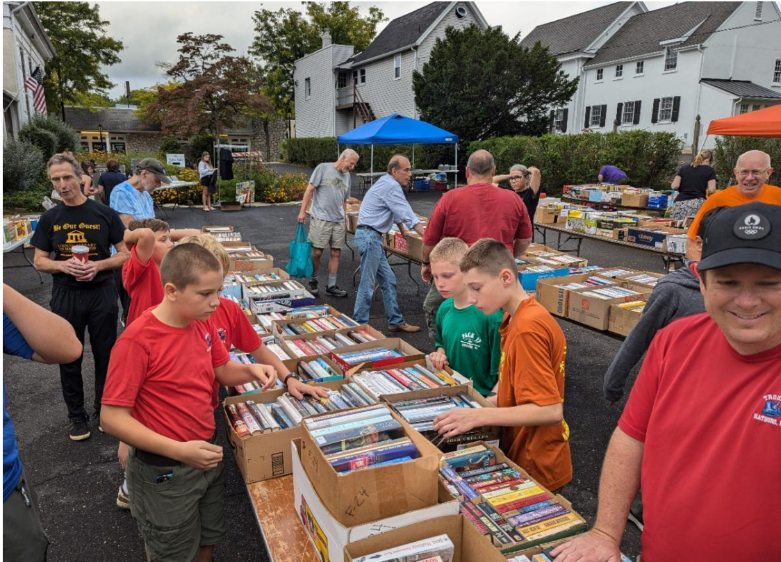
September - We did a Good Turn for the Union Library of Hatboro by helping to set up and take down their semi-annual Book Sale.