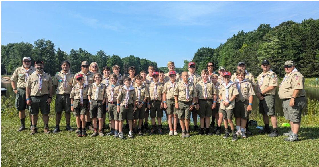
July - We enjoyed a great week at Camp Beaumont for Summer Camp.