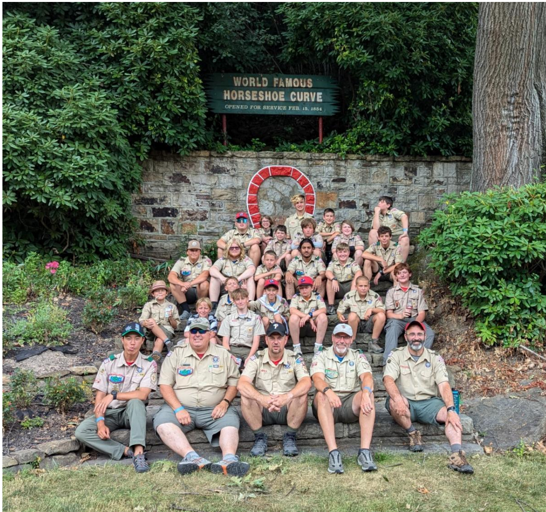
July - The lunch stop on our way home from camp was the World Famous Horseshoe Curve near Altoona, PA.