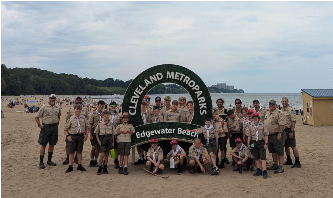
July - Here we are at our lunch stop by Lake Erie on our way to Beaumont.