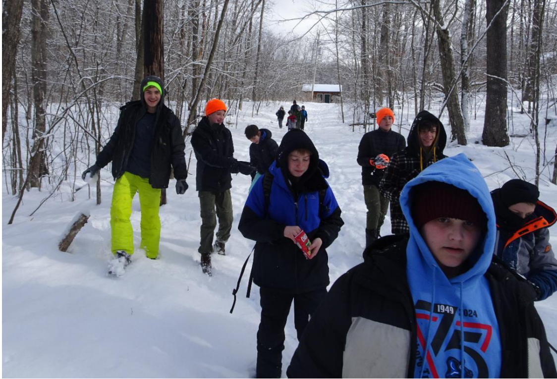
February - The annual trip to Resica Falls Scout Reservation for shooting and winter hiking. In this shot, we are heading down to Fossil Rock.