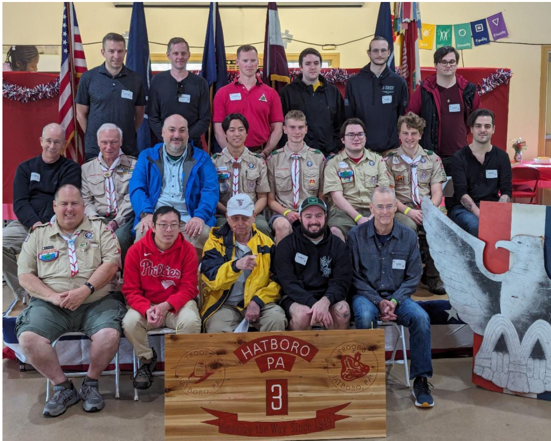
May - At the Diamond Jubilee, we took the opportunity to get a portrait of all the Troop 3 Eagle Scouts who were present.