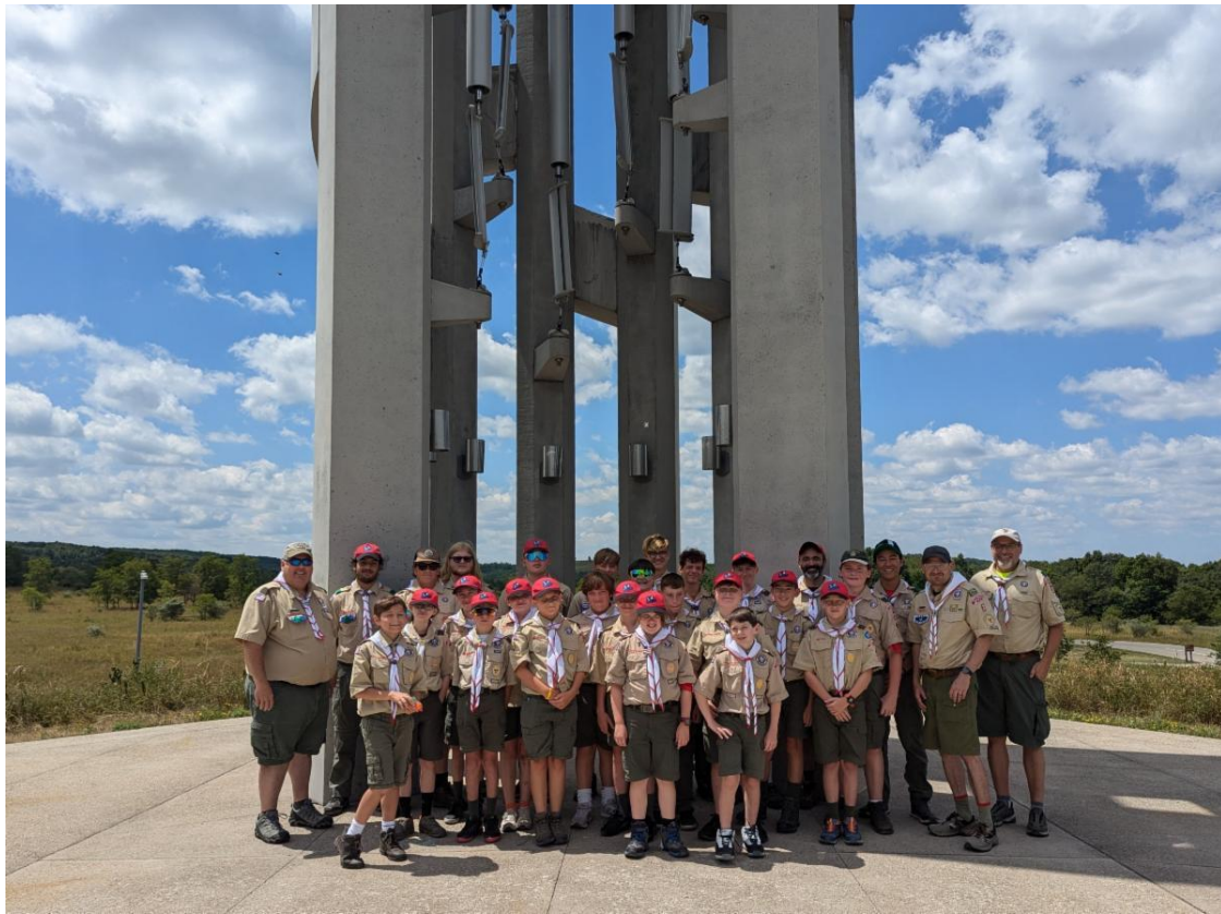
July - We stopped at the Flight 93 Memorial on our way out to summer camp in Ohio. Here we are at the Tower of Voices.