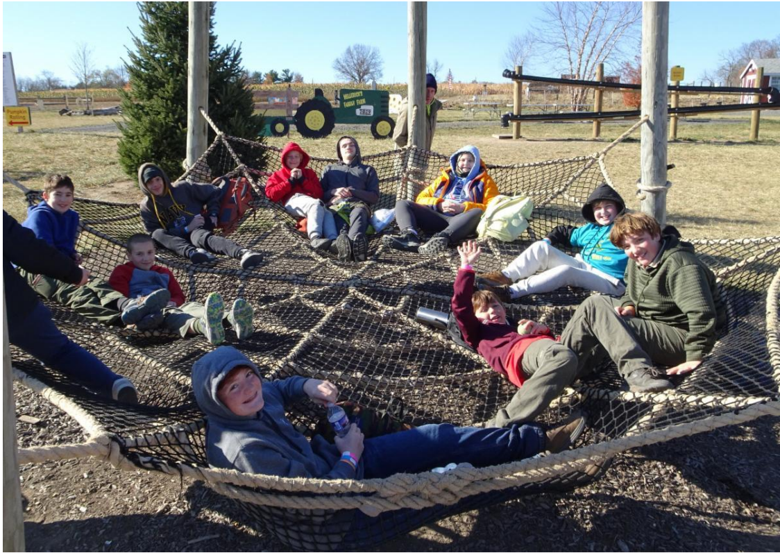
November - Whooped after a day of adventure.