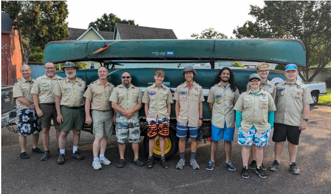
August - The Venture is assembled before heading out to paddle the Upper Susquehanna River.