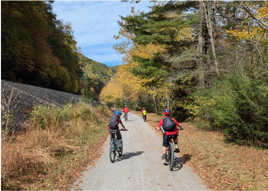
October - It was absolutely gorgeous weather for the ride through the Lehigh Gorge.