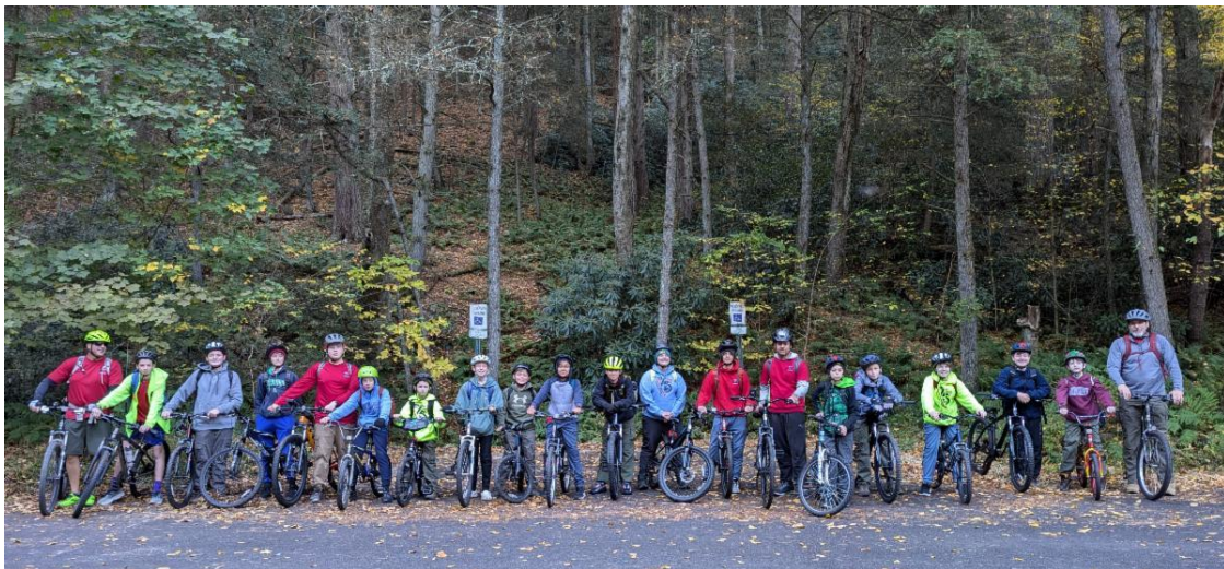
October - We biked over 20 miles on the D&L Trail near Hickory Run and Jim Thorpe.