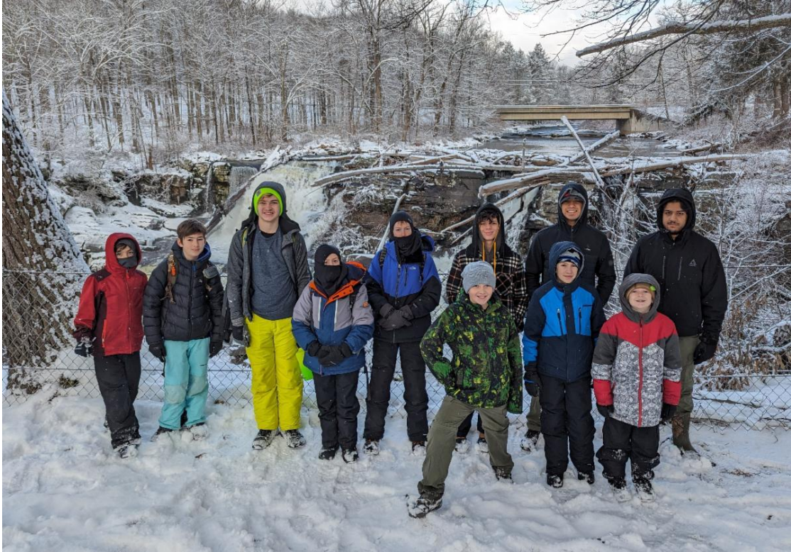
February - Here we are at Resica Falls.