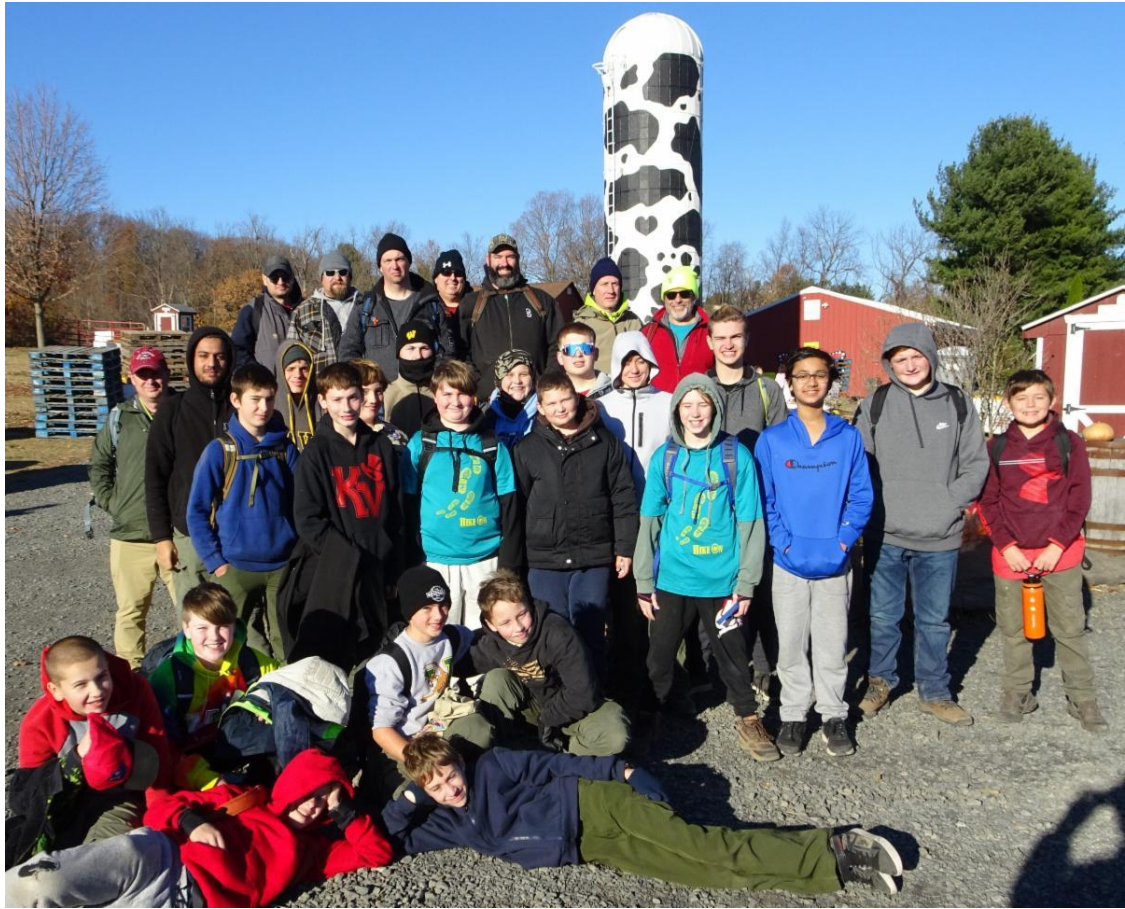
November - Soaking up November sunshine at Hellerick's Adventure Farm.