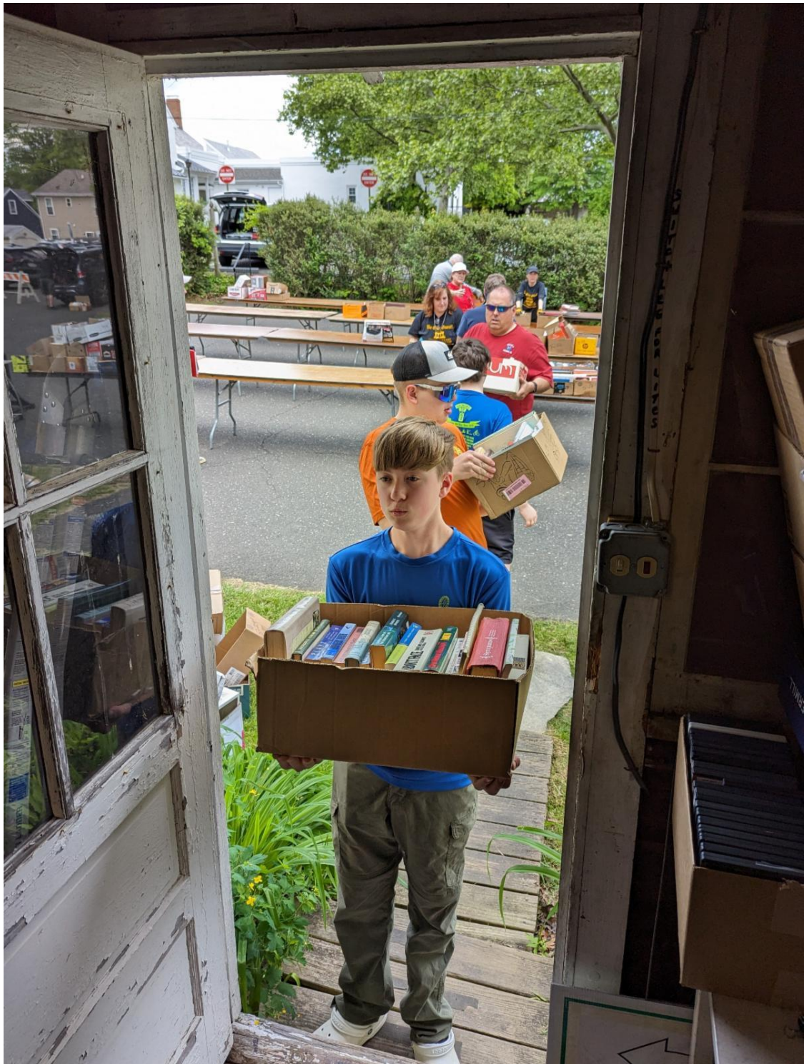
May - Providing service to the Union Library of Hatboro.