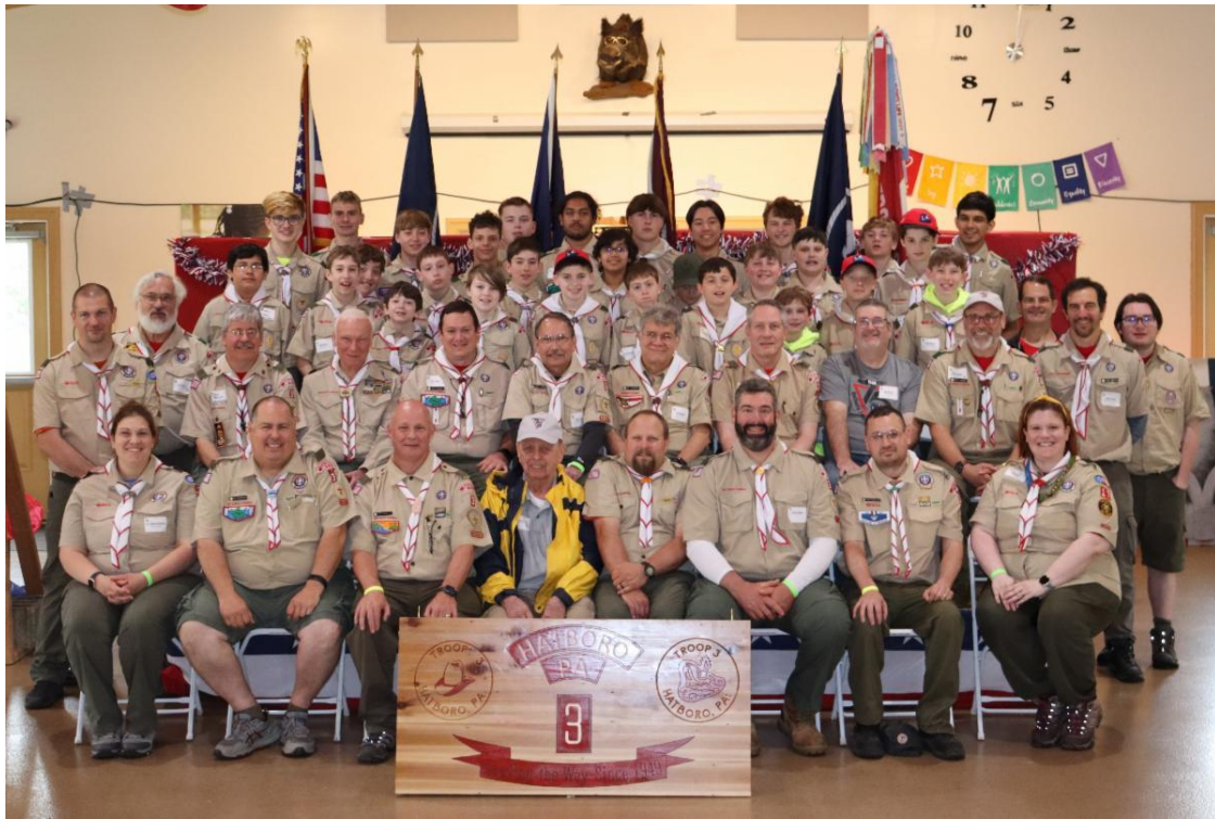
May - We celebrated our 75th Anniversary at the Diamond Jubilee. Here is the entire troop all decked out with our new neckerchiefs.