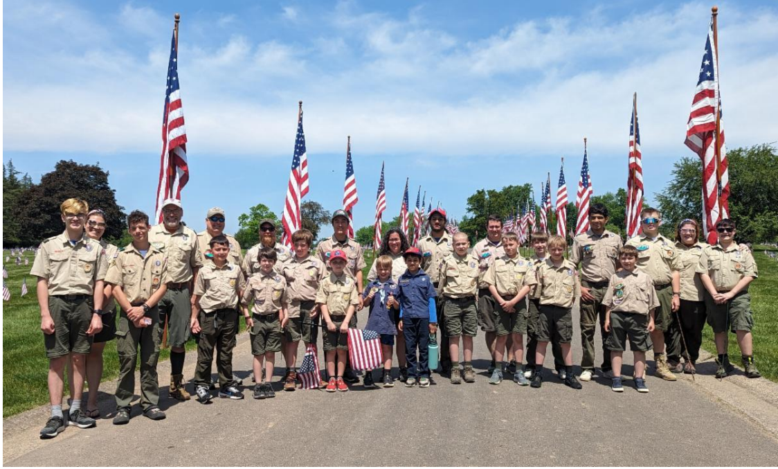
May - Providing Service to Whitmarsh Memorial Park, placing flags at Veterans' graves on Memorial Day.