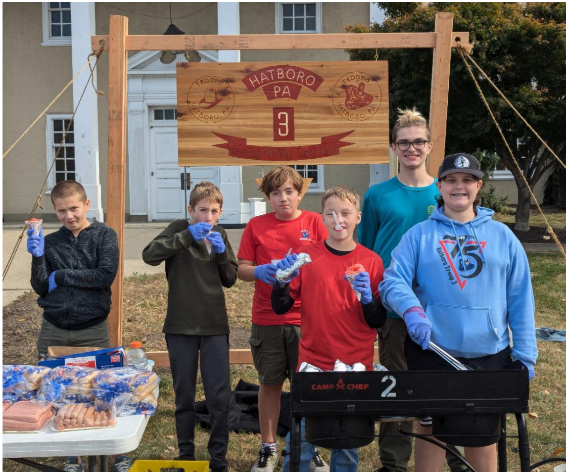
October - We held a Yard Sale during the Hatboro Halloween Stroll. The Scouts had a ball serving up hot dogs and "Scout Ice".