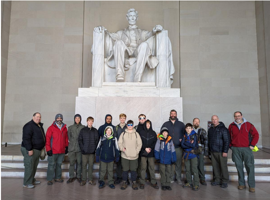
January - You can't go to the National Mall and not pay a visit to Honest Abe!