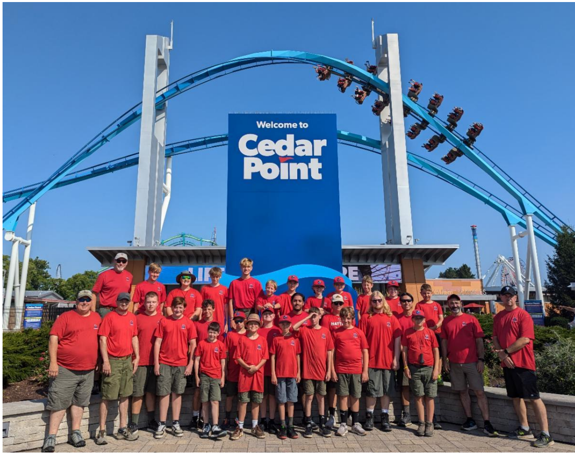
July - We enjoyed a day at Cedar Point and rode some world class coasters before heading to Camp Beaumont for the week.