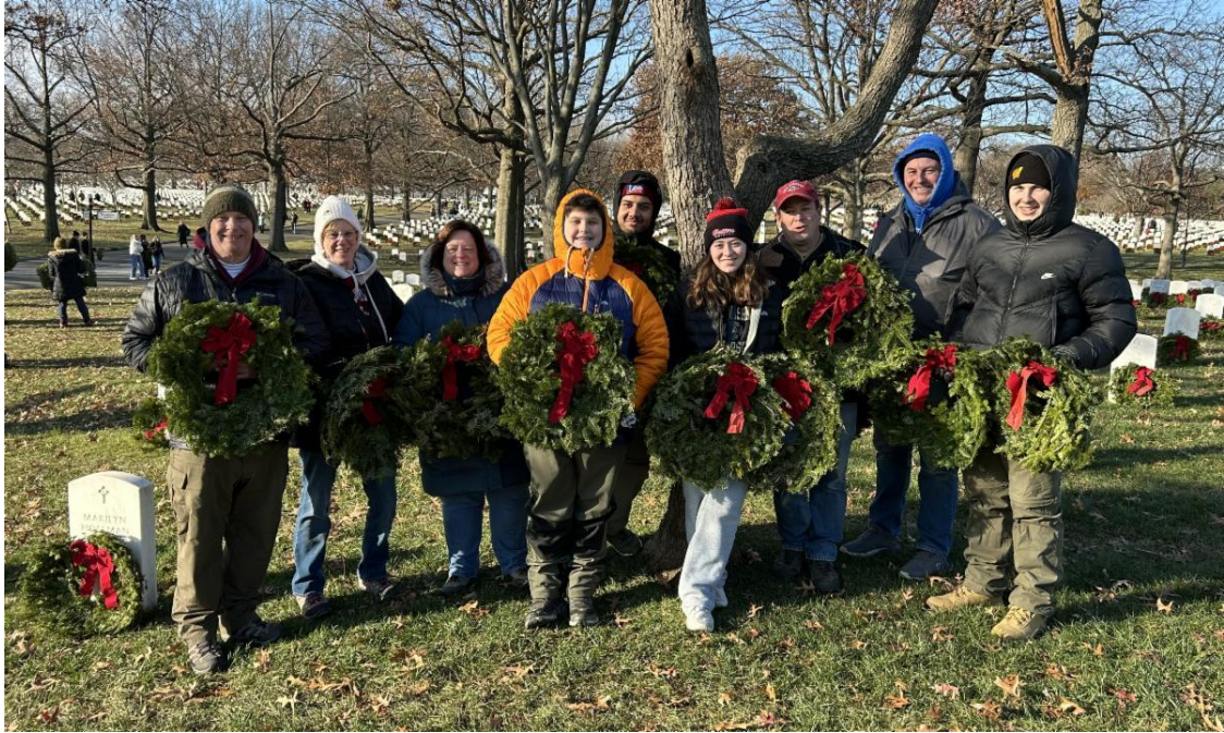
December - Wreaths Across America at Arlington National Cemetery.