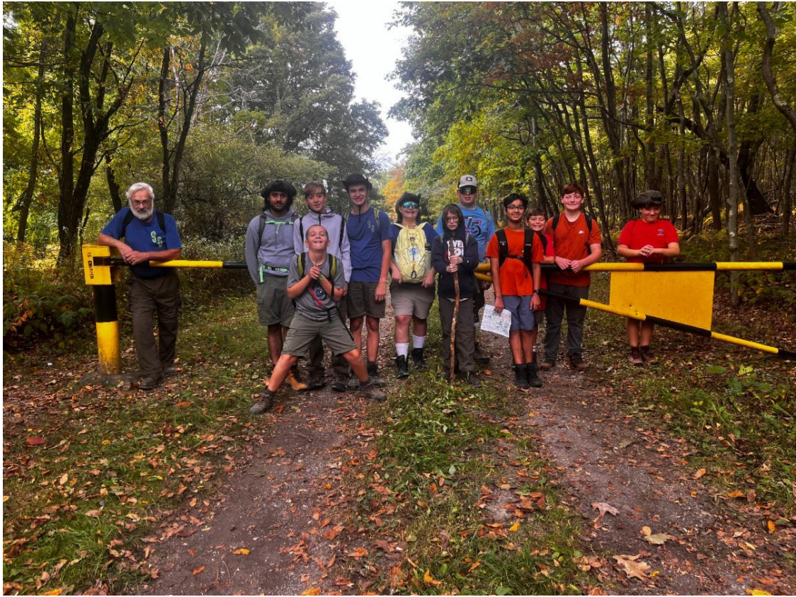
September - We backpacked a segment of the Quehanna Trail. I missed this one, but I heard it was great.