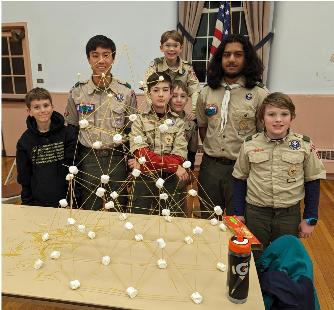
January - STEM Night, building marshmallow and spaghetti structures