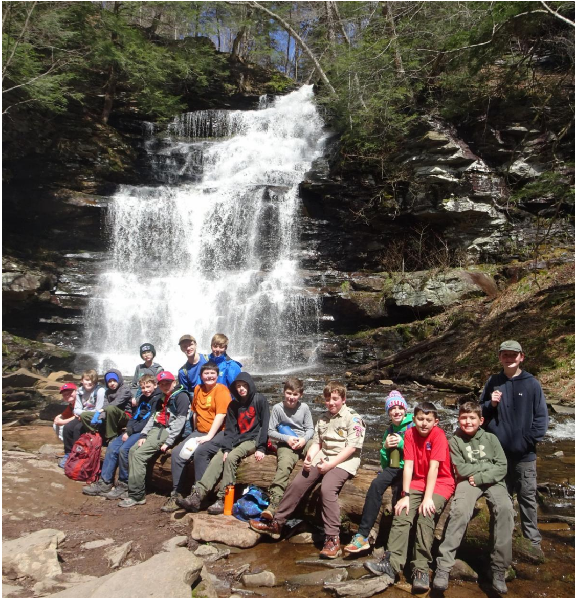
April - Here we are at Tuscarora Falls