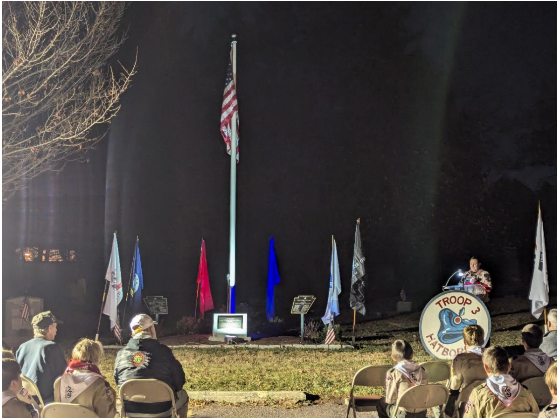
November - Veterans Night at the Veterans Memorial in Hatboro Baptist Cemetery.