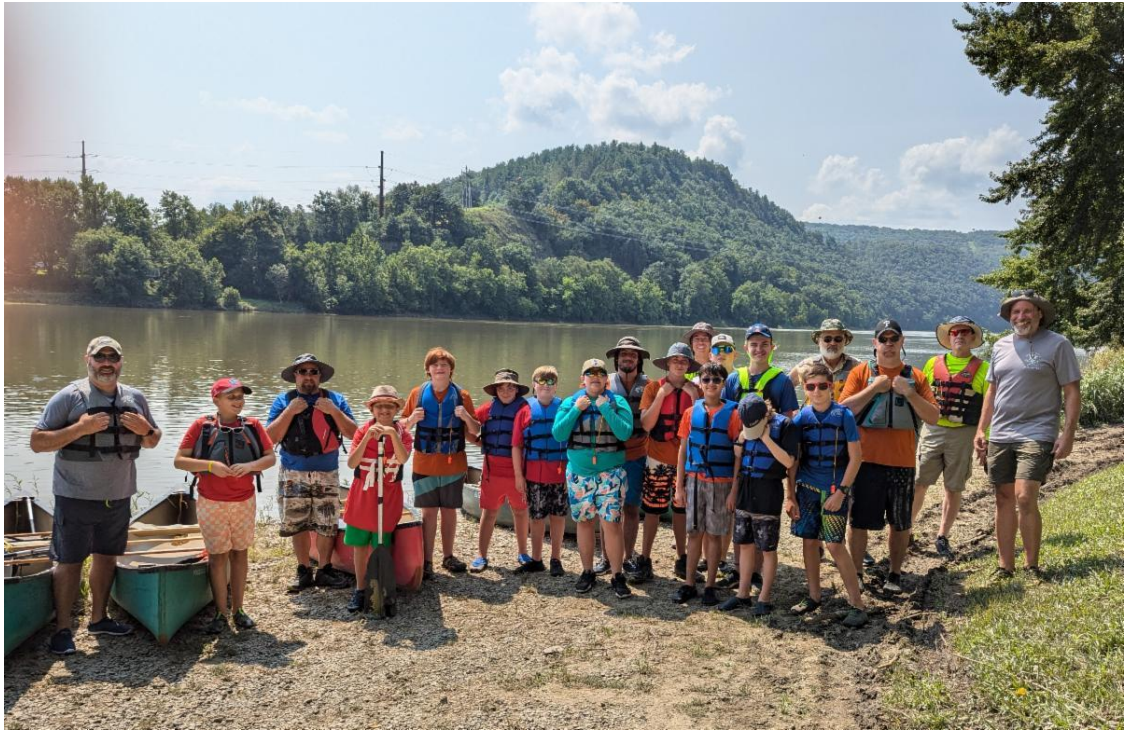
August - The Venture Crew met up with the rest of the Troop at Wysox for a weekend paddle. We camped at French Azylum but had to leave the river early due to pending severe weather.