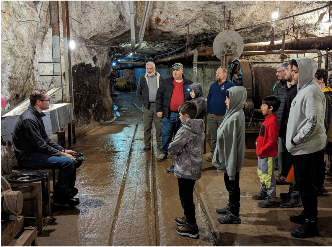
March - Here we are on the Mine Tour.