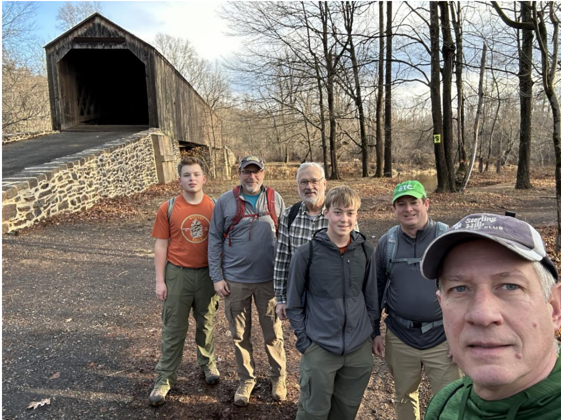
December - The Venture Crew did a 5-mile training hike at Tyler State Park.